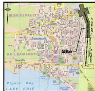
East Side Arterial Road

The contractor "S.L.R. Contracting Group Inc." is expected to start construction in mid May with all work completed on or before September 30, 2010.