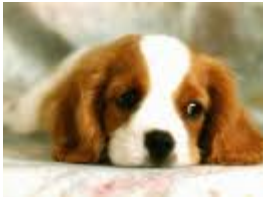
Make sure my tag is current

Residents may only hold 3 yard/garage sales per calendar year