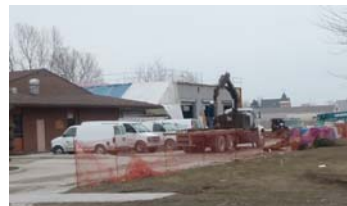
New EMS Station on Wilkinson