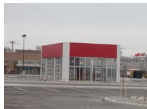
New instant lube