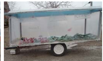
Fresh greenhouse produce and it's still March!