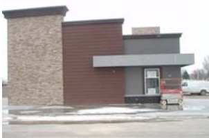
Shoeless Joes nearing completion