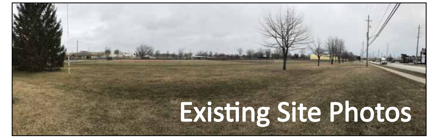
Existing Site Photos